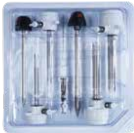
GYTR-II Kit A