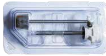
GYTR-II(Stainless steel type)