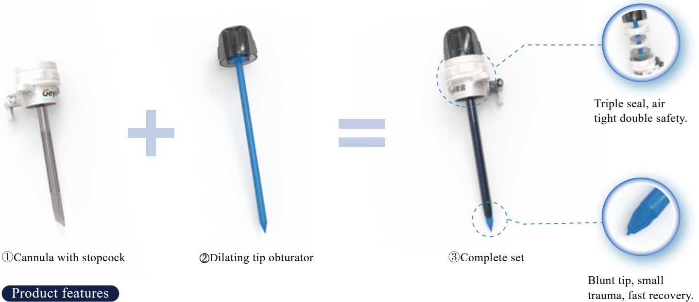
①Cannula with stopcock