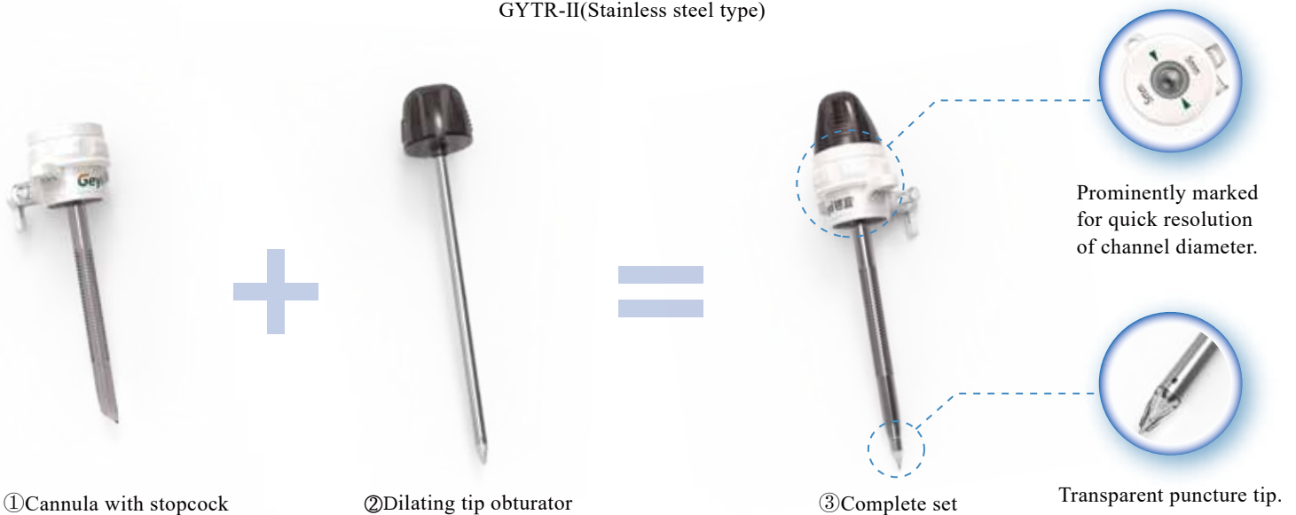
①Cannula with stopcock